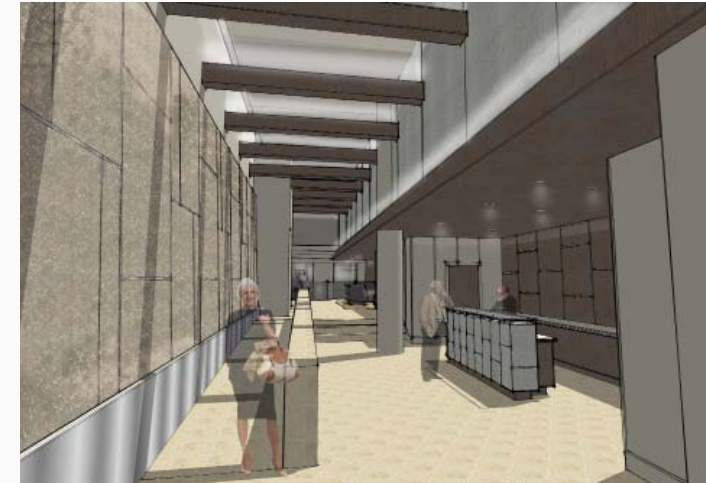
Lobby View from Vestibule