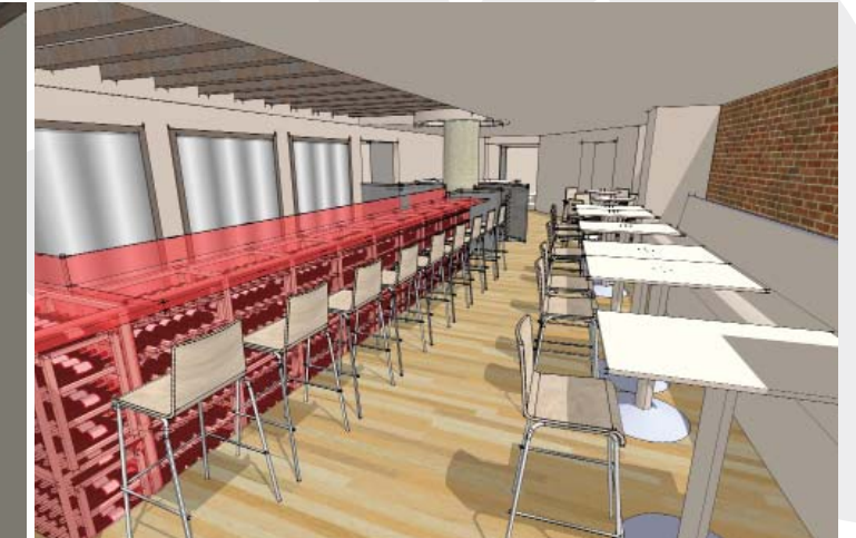
View of Enoteca from Window