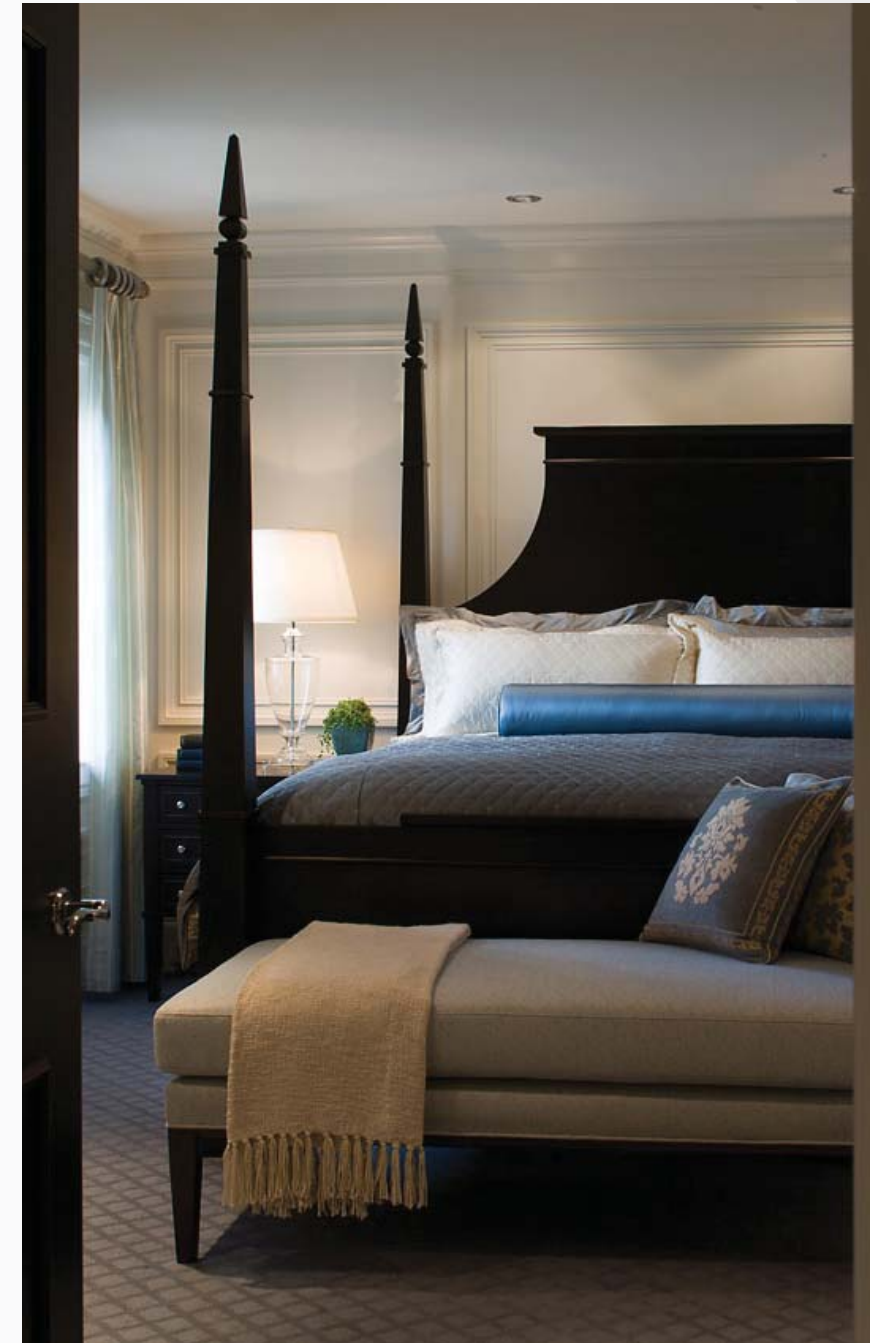
Presidential Suite Master Bedroom

Guestrooms, long and narrow due to the building's column spacing, presented an architectural challenge. Angled entry foyers were created to visually divide the rectilinear spaces, resulting in rooms that appear wider, with lofty ceilings and high windows furthering the sense of spaciousness. Tall, inlaid mahogany headboards, sumptuous seating and elegant fabrics embrace the history and drama, providing an authentic, unique experience.